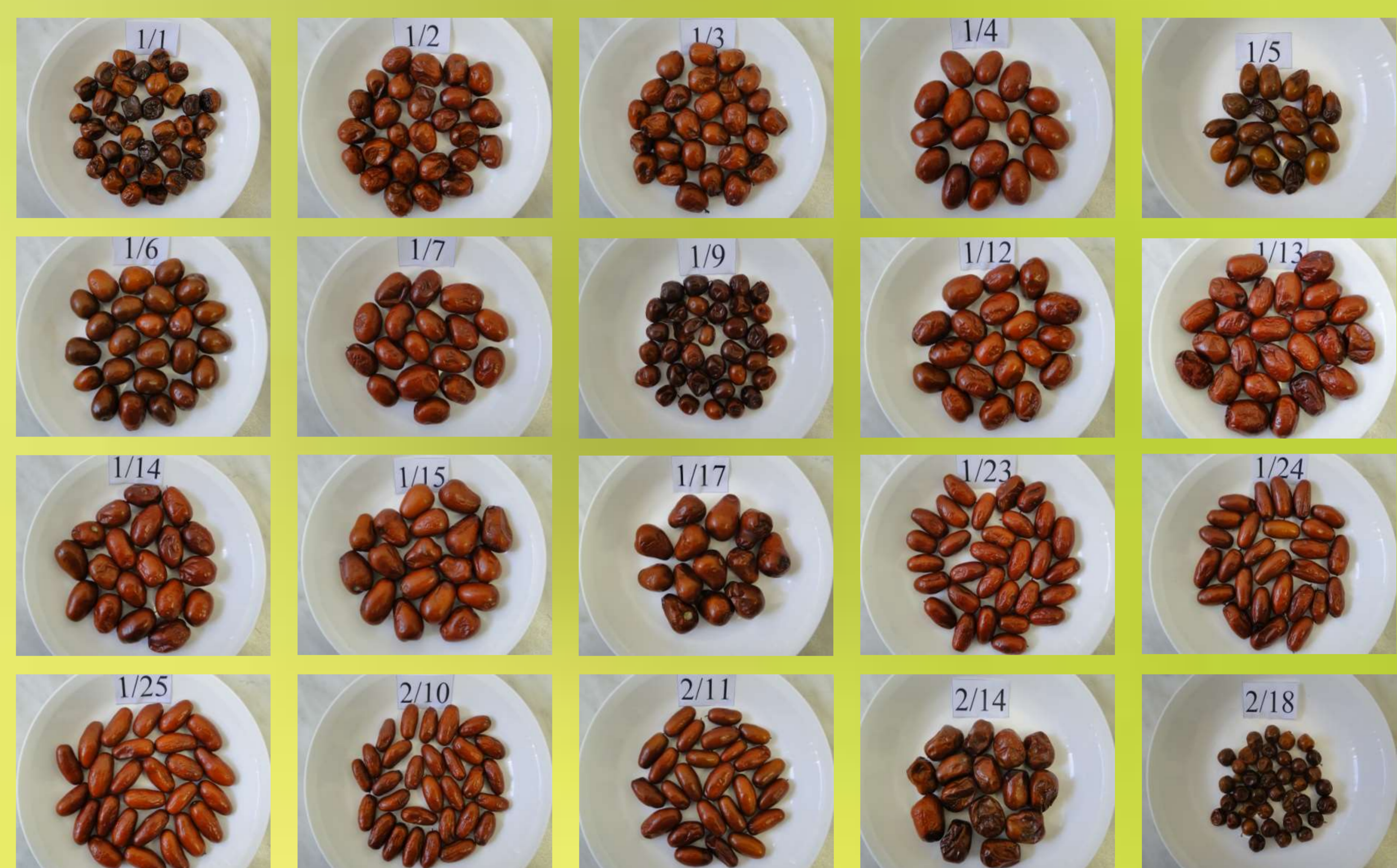
Figure 1 The variability in shape and colour of Ziziphus jujuba ( Ziziphus jujuba Mill.) fruit

Legend: r – Pearson's Correlation Coefficient; Sr – Standard Error of the Coefficient; 95% Confidence Interval; r 2 – Coefficient of Determination; t – Test for the Significance of the Coefficient; Probability of t (p)